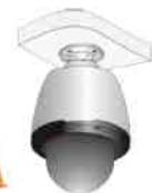
Standard Flush mount