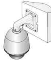
Standard Wall mount

** Supplied 12V DC power supply recommended and must be powered within a hundred and fifty feet using this DC voltage**